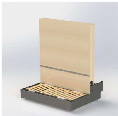
Closed H 218cm / P 147cm*

Feel free to contact us for any information info@azzuraworld.com