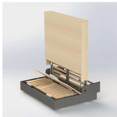
Width fonction on bed size