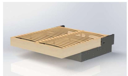
Opened H 48cm / P 218cm*